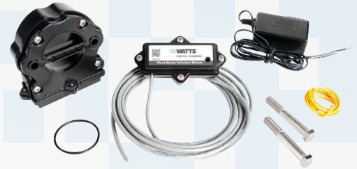
BMS Sensor Retrofit Connection Kit Shown

Series LF909-FS/909RPDA-FS now come standard with an integrated flood sensor. Activate flood detection technology through an add-on connection kit and enjoy peace of mind with real-time alerts when potential flood conditions are detected in your facility.