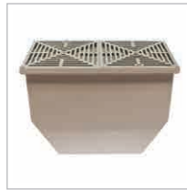
Sanitary Floor Sinks