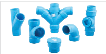
Acid Waste Fittings and Piping