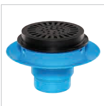
Floor Drains and Cleanouts