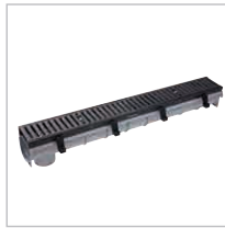
Trench & Parking Area Drains