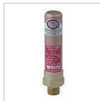
Water Hammer Arrestors & Specialties