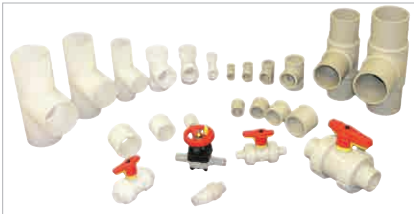
High-purity Piping and Faucets