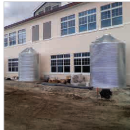
Water Storage Tanks