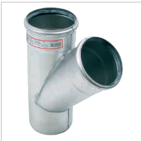
Piping and Fittings