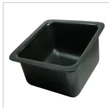
Corrosion Resistant Lab Sinks