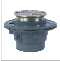
Floor & Area Drains