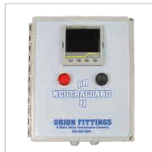
Neutralization Tanks and System Monitors